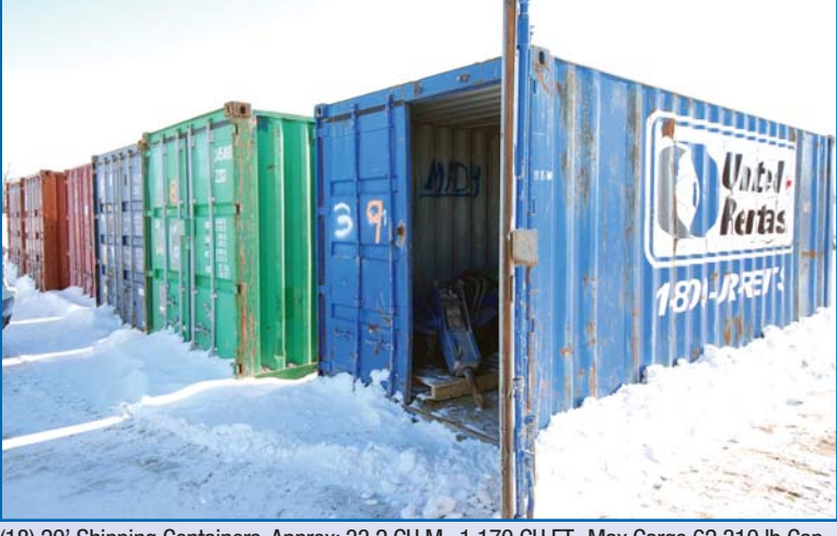
(18) 20' Shipping Containers, Approx: 33.2 CU.M., 1,170 CU.FT., Max Cargo 62,310 lb Cap.