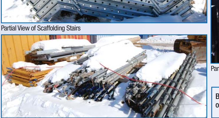
Partial View of Scaffolding

Large Quantity Of Barricade Fencing, Hoarding, Scaffolding, Concrete Forming Panels & Hardware, Lumber, Construction Garbage Chutes, Twin Crane Power Supply, Electrical, Cords, Outlet Boxes, HD Pumps, 8 Concrete Vibrators – Up To 2.5", 10 Concrete Whips, Electric Concrete Mixer