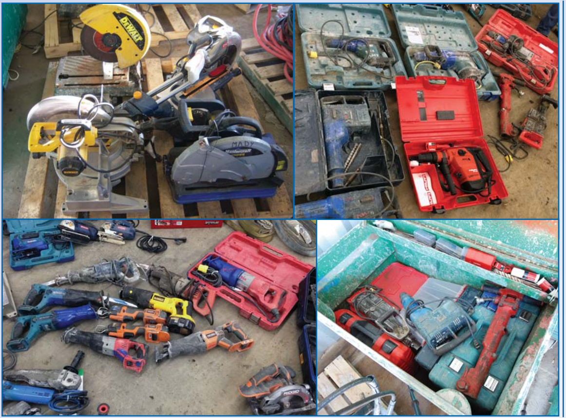
Partial View of Saws, Drills, Power Tools & Electrical