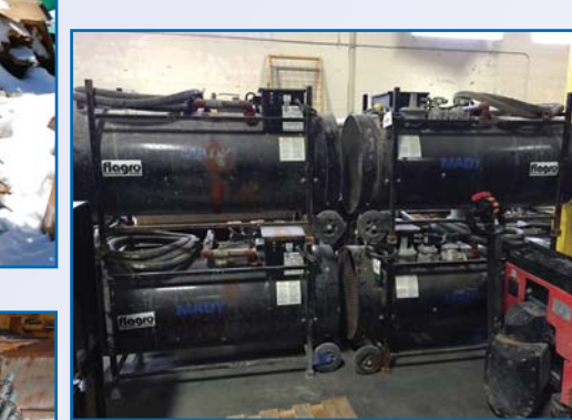
Partial View of 4 Gas Heaters