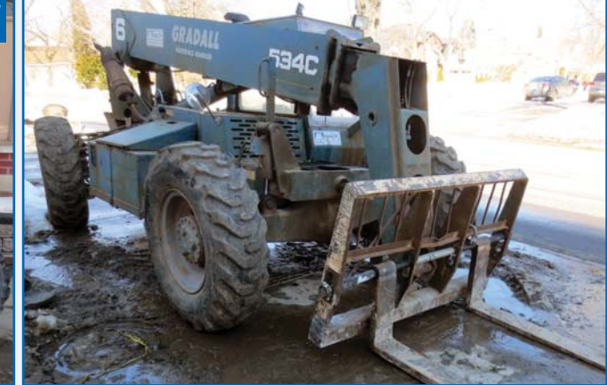
GRADALL Telehandler, Model 534C-6, 40' Lift, 6,000 lb Capacity, 6,236 hrs, sn 288352

CATERPILLAR Bulldozer, Model D6K, LPG, 10' Blade, 4,646 hrs, sn CAT0006KTDHA00359