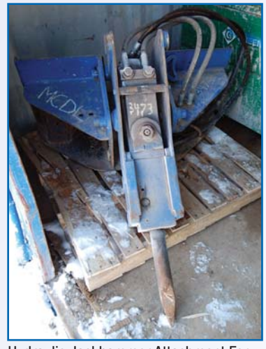
Hydraulic Jackhammer Attachment For Skid Steers