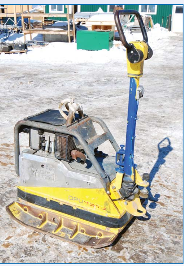
WACKER Plate Tamper, Model DPU4545, sn 10059371