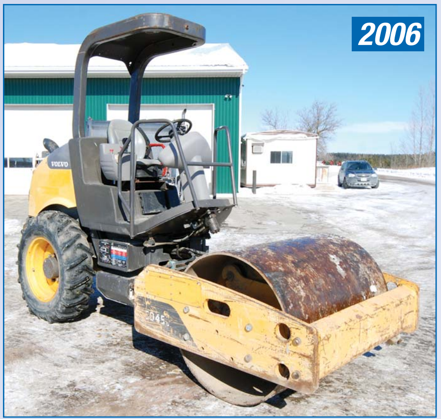
VOLVO 54" Smooth Drum Roller, Model SD45D, 137 hrs, sn 198155