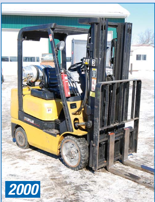
CAT Forklift, 4,700 lb Capacity, Model GC25K, 3 Stage Mast, Side Shift, 188" Lift, 5,521 hrs, sn AT82C05092