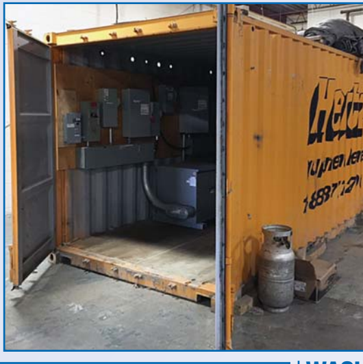
Electrical / Power Distribution Shipping Container with Breakers, Transformers Etc.