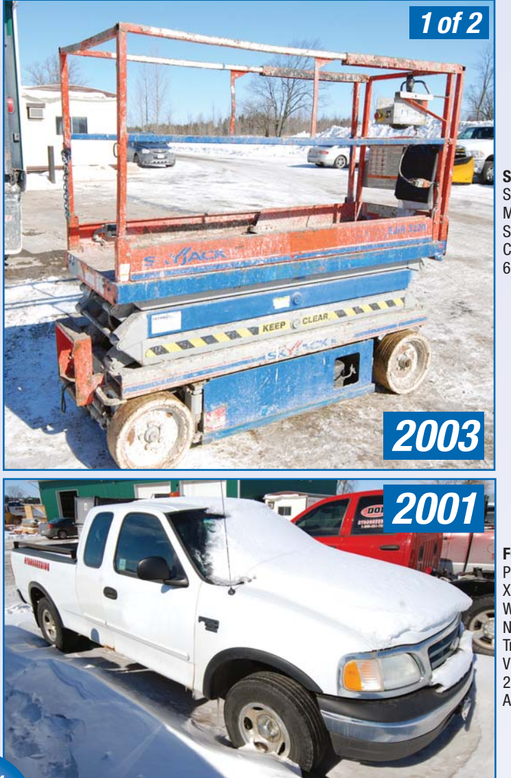
SKYJACK Scissor Lift, Model 3220 – SJ III, 900 Ib Capacity, sn 615313